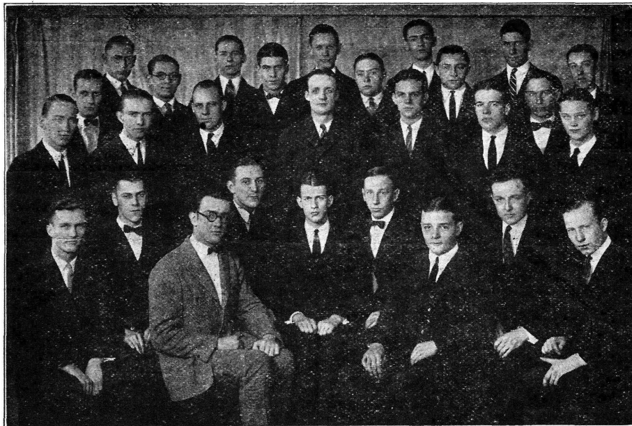
THE CHAPTER 1923-1924

Possibly you can suggest some way in which the active chapter can co-operate with you to this end. We hope you will send your suggestions in to us.