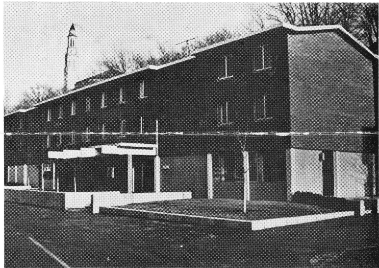
The Present House on Murray Hill Road.