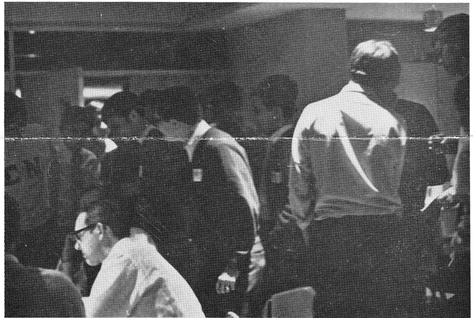
Brothers at the fall alumni stag

The card players found each other early in the evening and stayed late. When singing started it turned out that the alumni and collegiate members knew different verses to old favorite songs and both groups took turns entertaining the other. Enthusiasm was shown by a group of the alumni by serenading and re-initiating a local fraternity house. All who attended this meeting are looking forward to the next alumni meeting on May 22.