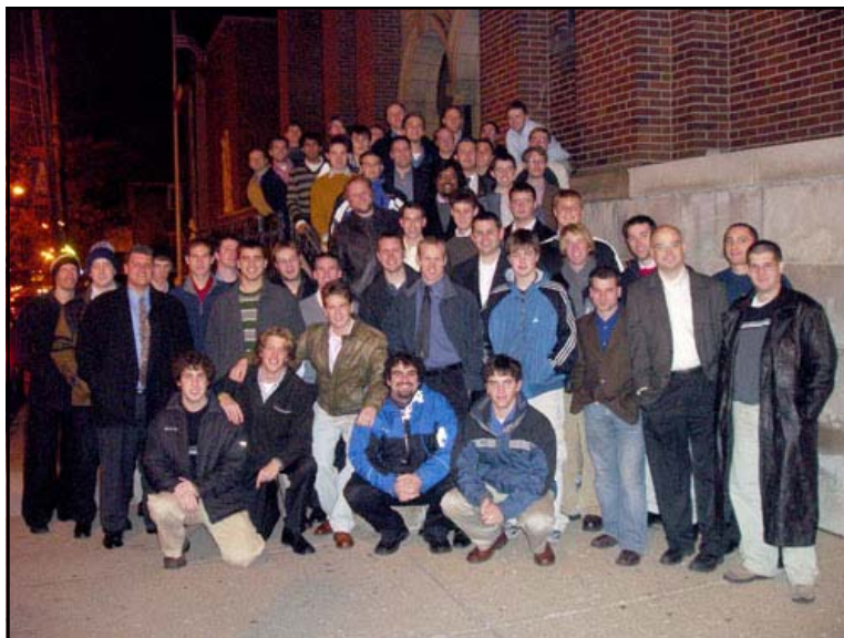
A group shot from AAC in fall of 2005. AAC will take place the weekend before Thanksgiving this fall. More details in the next newsletter.

Alumni are welcome and encouraged to attend all events, doubly so for all ritual events (Pledging, Brothering, Knighting). For dates, consult the calendar on the active website.