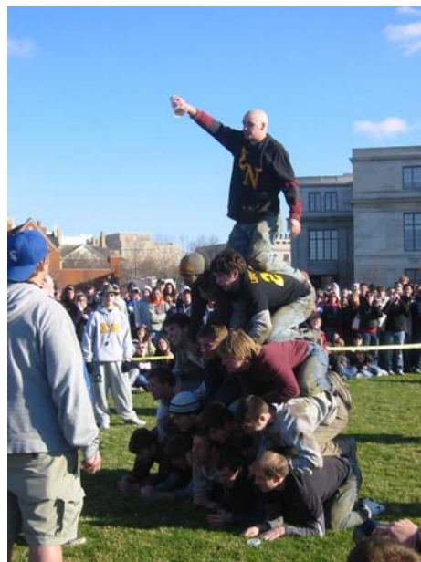
Sigma Nu's Pyramid at Greek Week 2006. Sigma Nu hosted the event, as well as taking home second place.

Sigma Nu has been consistently at the top of the final Greek Week standings for the past several years. This past spring Sigma Nu finished third overall in Greek Week, taking first place in variety show and banner, second in pyramid, and third in Greek Sing.