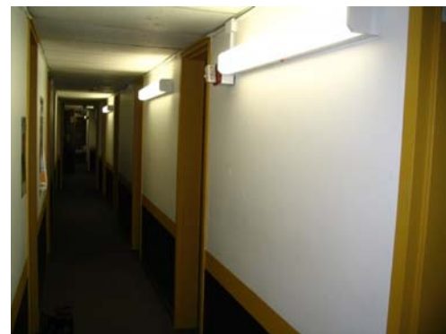
(from top) A new mural, and the newly painted third floor hallway.

The basement is also undergoing some changes. A new, brighter paint job and new carpet make the large room seem less dungeon-like. Brothers living in the house have a renewed interest and devotion to making the house a great place to live this semester, and the results of this have been obvious.