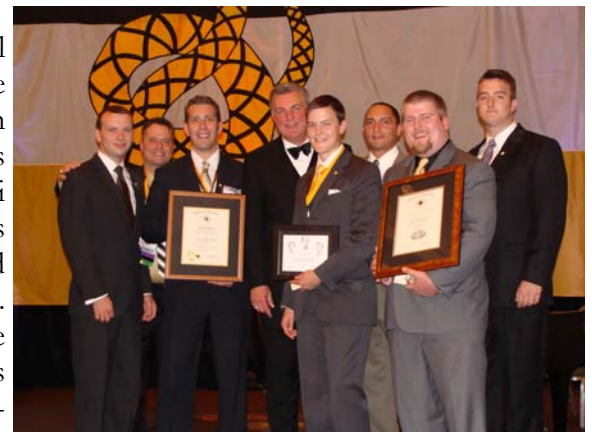
Delta Alpha alumni and actives celebrate their awards