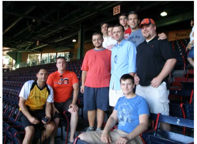
Delta Alphas at Fenway Park

In addition to the scheduled activities at Grand Chapter, Delta Alpha hosted a dinner prior to the July 4th fireworks at the Hilton for the chapters from our Division: Zeta Gamma (Kent State), Kappa Lambda (Akron), and Beta Iota (Mt. Union). Also attending were the Brothers from Delta Iota (Washington State University) in honor of the announcement that the High Council had approved the rechartering of Delta Iota for the coming school year. The 23 attendees had a good time with the purpose of building ties between the chapters. Grand Chapter 2012 will be held in Dallas, Texas.